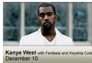
Kanye West with Fantasia and Keyshia Cole December 10