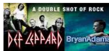
Def Leppard & Bryan Adams November 8