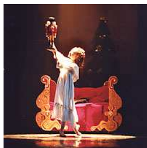
The Nutcracker 2005

Olympic Ballet Theatre Montlake Terrace Performing Arts Dec 3 & 4 2pm Meany Hall Uof W Dec 10 & 11 2pm Everett Performing Arts Center Dec 18 2 & 6pm