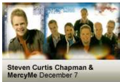
Steven Curtis Chapman & MercyMe December 7