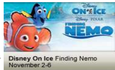
Disney On Ice Finding Nemo November 2-6