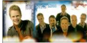
Steven Curtis Chapman & MercyMe December 7