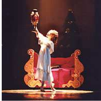
The Nutcracker 2005

Olympic Ballet Theatre Montlake Terrace Performing Arts Dec 3 & 4: 2pm Meany Hall, U of W Dec 10 & 11: 2pm Everett Performing Arts Center Dec 18: 2 & 6pm