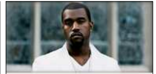
Kanye West with Fantasia and Keyshia Cole December 10