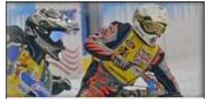
World Championship Ice Racing December 18