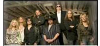
Lynyrd Skynyrd December 16